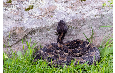
Coiled rattlesnake waiting for prey.

In 2021, we saw five different rattlesnakes, all black phase and all around 44 inches in length. We saw one snake coiled at the base of a large rock in our yard, the classic pose of the ambush predator. No doubt it smelled a trail of chipmunks or squirrels. It waited at the rock for hours, until it got too dark for us to see. Rattlesnakes use their pit organs as thermal sensors, so they are able to locate their prey at night. The snake was gone by morning, so we don't know if it was successful or not.