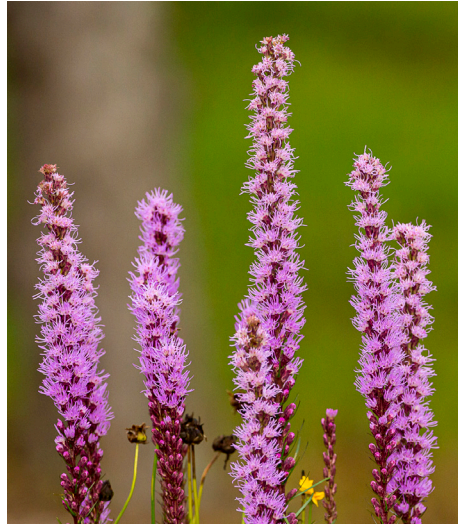
The blazing star is known to attract the endangered eastern massasauga.

Jennings Environmental Center near Slippery Rock in Butler County plays an important role in protecting the prairie habitat where these small rattlesnakes are still found in Pennsylvania. We've visited the 20-acre prairie ecosystem several times, but never saw the shy and secretive eastern massasauga. Jennings is also remarkable for its glorious prairie wildflowers when they are in full bloom in mid-summer. One of the most spectacular prairie flowers is the rose-purple blazing star ( Liatrix spicata ). There are over 200 other prairie plants found at Jennings, which was actually the first reserve in the state to protect an endangered plant, the blazing star. Not many