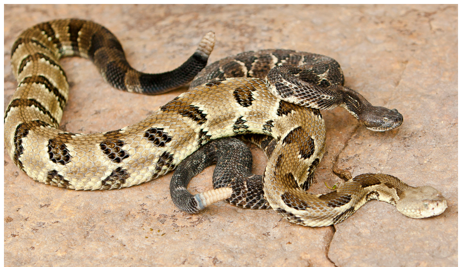
Comparing the coloration of a black phase rattlesnake and a yellow phase rattlesnake.

Most of the rattlesnakes that we see on our property are black phase, referring to the black head with black eyes. The yellow phase has a yellow head with yellow eyes, but the body often darkens to black closer to the tail, as shown in the photo below.