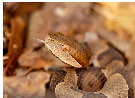
Note the coppery head and forked tongue.

Why do we like snakes so much? There are many reasons, but for us, they represent the wild part of nature that many